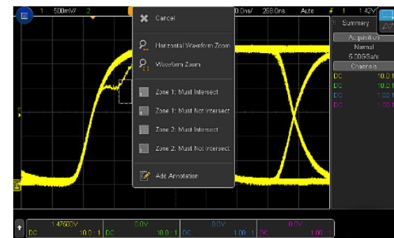
Zone trigger (standard)