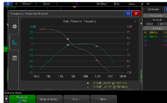
Frequency response analysis - Bode plots (standard)